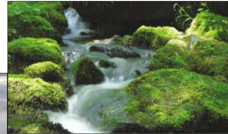
Upper Pete's Creek

M ajestic glacier-carved and glacier-fed Lake Quinault is surrounded by the mossy old growth trees of the Quinault Rain Forest, one of only three temperate coniferous rain forests in the Western Hemisphere.