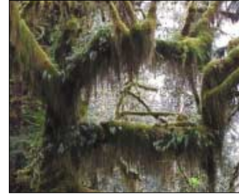
Moss and fern shrouded maple trees

The Quinault Valley receives an average of 12 feet of rain per year, nourishing an incredible and complex temperate rain forest ecosystem. Most of the rain falls in the winter months. The wettest year on record was 1999 when 182.48 inches (over 15 feet!) of rain fell in the Quinault Valley.