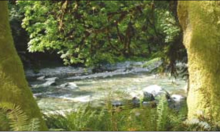
Big leaf maples along Quinault River