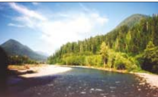
Upper Quinault River Lake Quinault Resort photo

The first road was built to Lake Quinault in 1914. Previous access was only by wagon trail, path, or river. The first auto made it to Quinault in 1912.