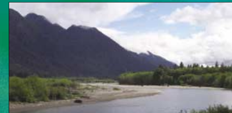
Quinault River, view looking west