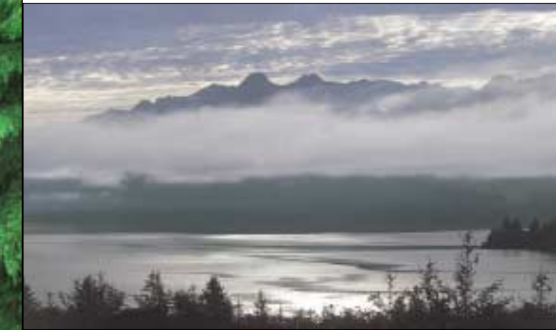
Lake Quinault view from west end

At Lake Quinault you will find astounding beauty and grandeur.