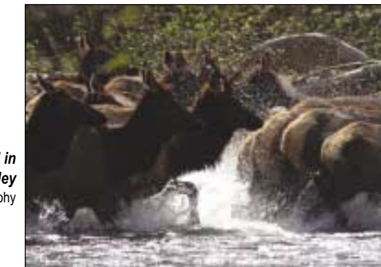
Elk herd in Quinault Valley

Visit the most spectacular and varied Rain Forest on the Olympic Peninsula.