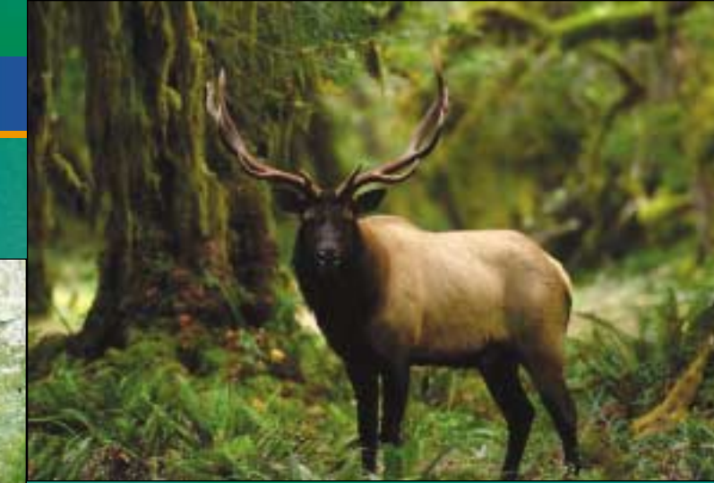
Elk in the Quinault Rain Forest

Hiking on the Quinault National Recreation Trails is an awesome experience. The rain forest scenery is inspiring. The trails are well marked and maintained. There are loops of many lengths. Find the one(s) just right for you. Most of these trails are of moderate difficulty with minor hills. Many are suitable for kids and elderly.