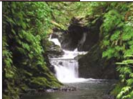
Falls Creek cascades