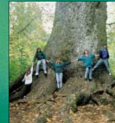
World's largest Sitka Spruce,

You may drive or hike to this awesome world record tree. It stands 191 feet tall, 17 feet in diameter, and 55 feet, 7 inches in circumference. Don't miss it!!