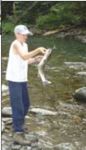
Fishing in the Quinault Valley

Temperate rain forests such as Quinault are true rain forests in more northern or southern latitudes than tropical rain forests. Temperate rain forests only exist on the Northwest Coast of North America, Chile, New Zealand, Southern Australia, and small patches in Norway, Britain, and Japan.